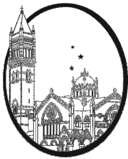
Gathered in 1669