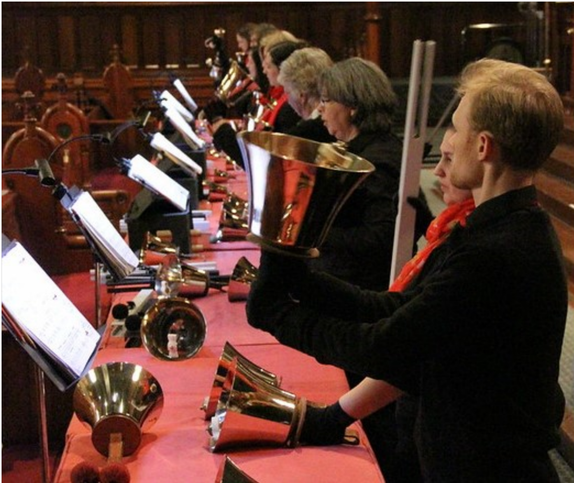
Old South Ringers Concert, December 2019