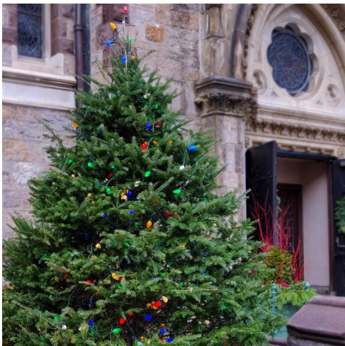
The lighted Christmas tree in the garden is given in loving memory of Marc Gaucher.