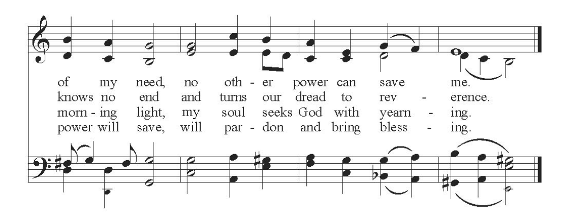
Notes on Today's Psalms