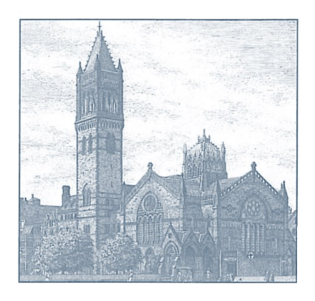
Old South Church Copley Square, Boston A Congregation of the United Church of Christ Gathered 1669